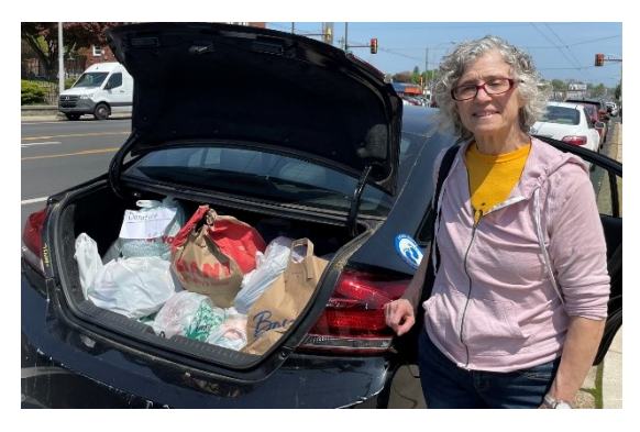
Ladies Auxiliary hosted a toiletry drive at Resurrection for St. Francis Inn. Below: Photos from the Pancake Breakfast